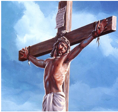
Superscription in Three Languages

His head on the Cross. This was written in three different languages—Hebrew, Latin, and Greek—the three main languages of that time. Likewise, we see a Gospel written to each of these cultures: Matthew to the Jews (Hebrew), Mark to the Romans (Latin), and Luke to the Greeks.