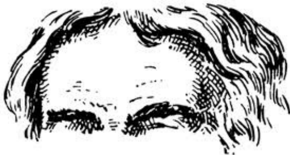
mark in their foreheads (mind–indoctrination)

Revelation 13:16-17 – "And he causeth all, both small and great, rich and poor, free and bond, to receive a mark in their right hand, or in their foreheads: And that no man might buy or sell, save he that had the mark, or the name of the beast, or the number of his name."