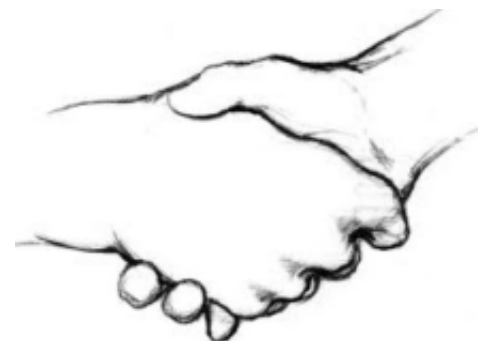
mark in their right hand (right hand of fellowship)